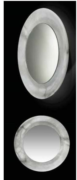
□ WHITE ALABASTER